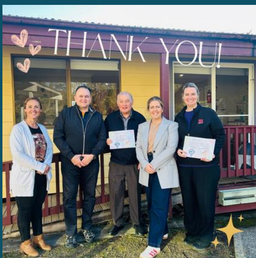
CENTRAL COAST WOMEN'S HEALTH CENTRE