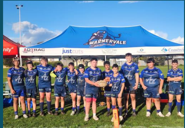
WARNERVALE BULLS JUNIOR RUGBY LEAGUE