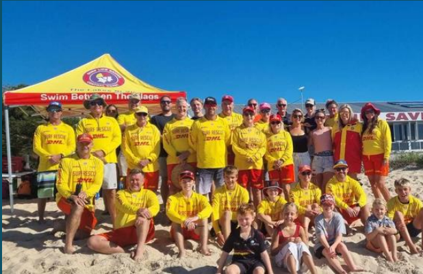
THE LAKES SURF LIFESAVING CLUB