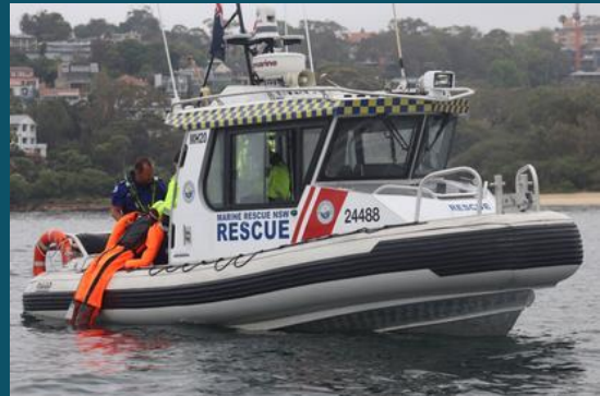
TUGGERAH LAKES MARINE RESCUE