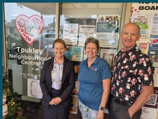
TOUKLEY NEIGHBOURHOOD CENTRE